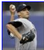
Seattle Post Intelligencer