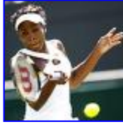
New York Daily News