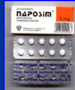
Dianabol Naposim or Thai