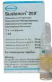
1 amp (250 mg/amp)