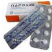
100 tabs (5 mg/tab)

- Brewers send 4 prospects to Indians for Sabathia (AP)