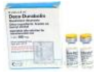
1 bottle (200 mg/bottle)