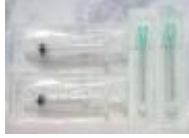
2ml Syringe and 1.5 inch needle